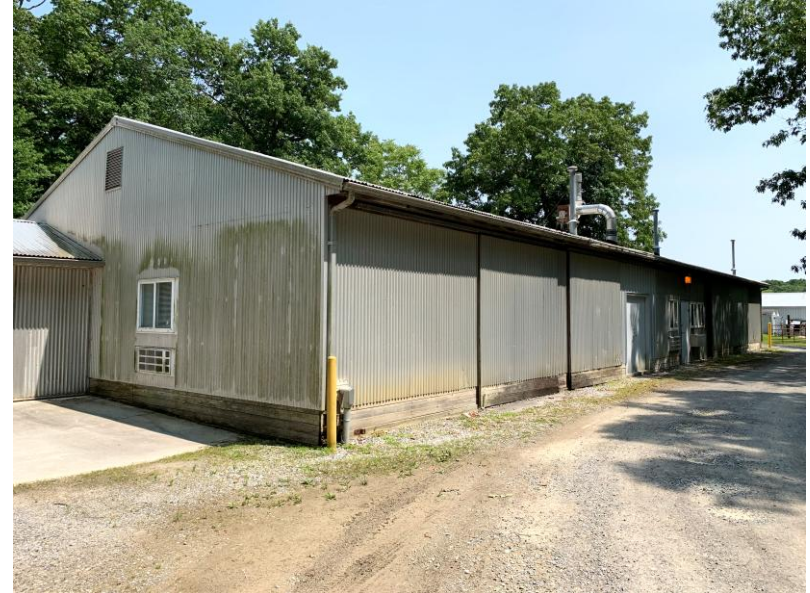
VIEW TO THE SOUTHEAST

/ DEMOLITION OF BUILDING 0584 (SOUTH WING)