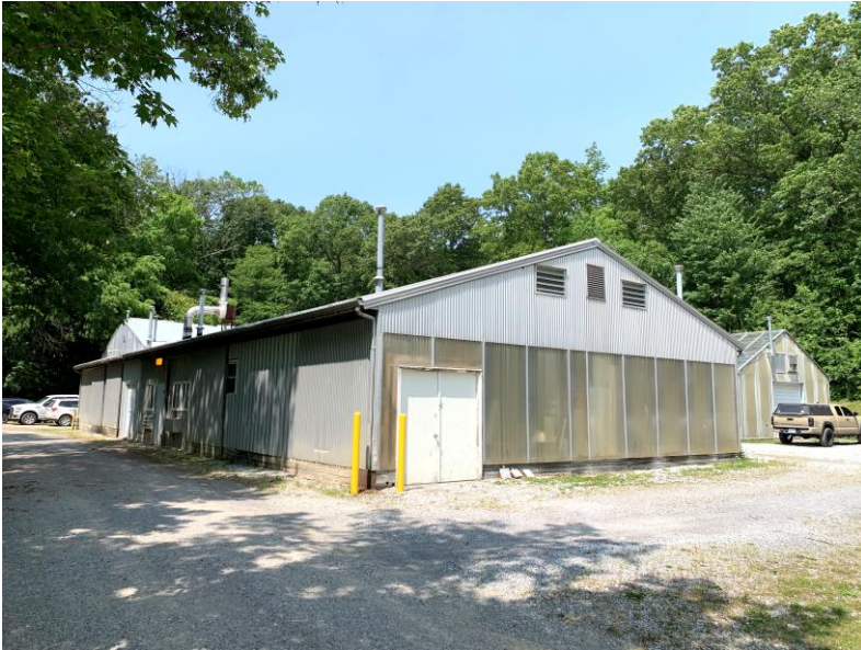
VIEW TO THE NORTHEAST